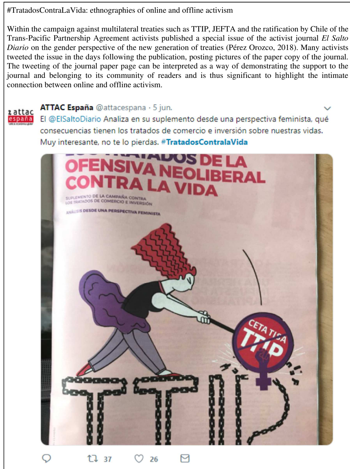
Table 1: Tweet posted by the journal El Salto Diario announcing the publication of a Special Issue dealing with trade agreements.