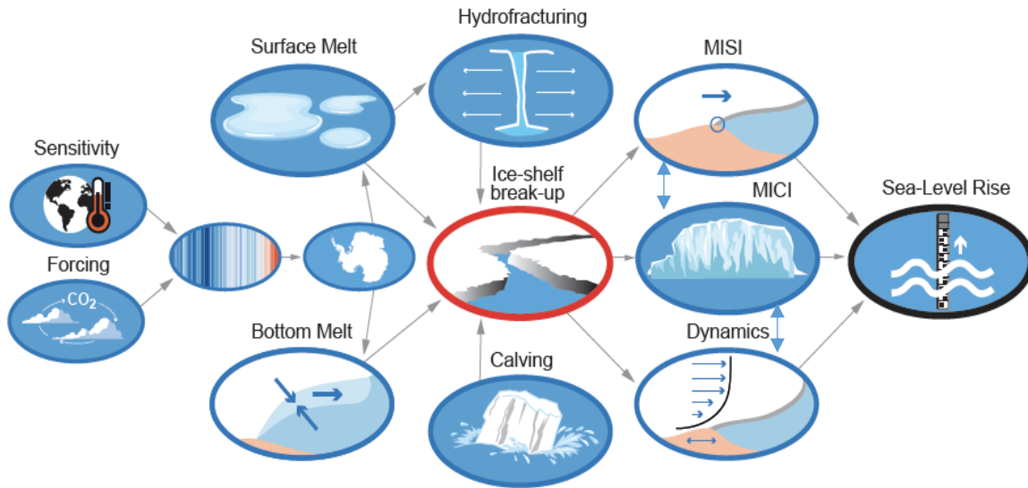
Fig 3: Causal relation between processes leading to a high-end contribution of Antarctica to SLR. The Antarctic climate response affects Surface Melt and Bottom Melt, which together with Calving and Hydrofracturing determine the stability of the ice shelves. If the ice shelves break up, the dynamics encompassing instability mechanisms like MISI and MICI and basal sliding control the final contribution of the Antarctic ice sheet to high-end SLR.