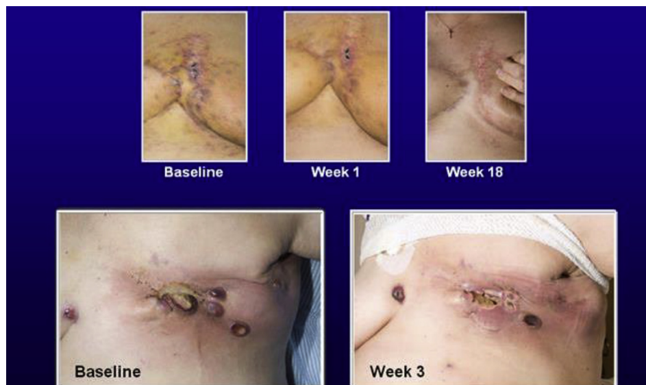
Fig. 1. Clinical responses to brivanib in patients with angiosarcoma.

AEs (regardless of causality) that occurred in \geq 10\% of the overall trial population are shown in Table 3. The most common AEs ( >25\% of patients) were fatigue, nausea, vomiting, decreased appetite, hypertension and